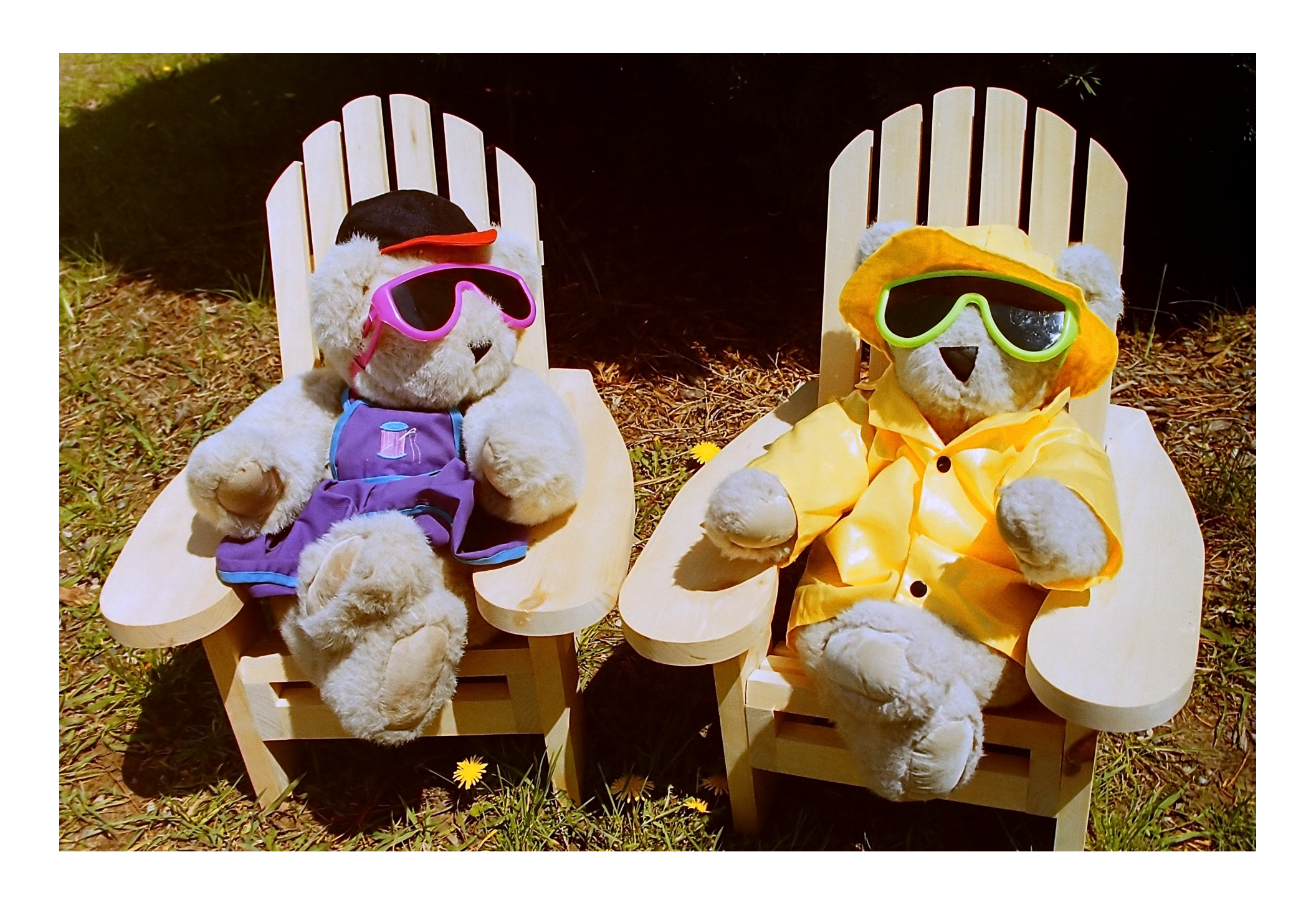
"Because," Theodore interrupted, "it's a rain coat!"