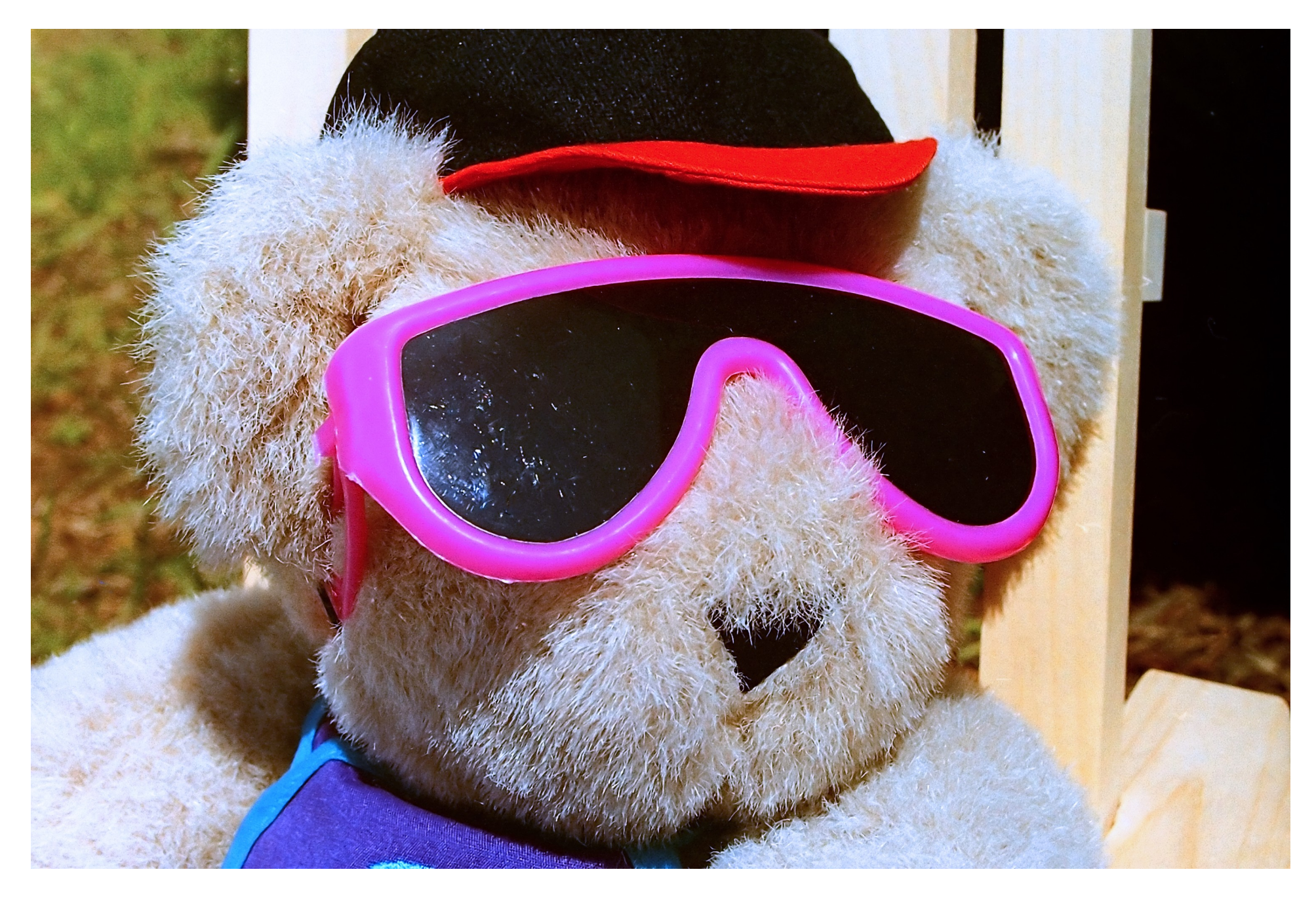
"Then why don't you put it on right now? After all, the sun is shining and the skies are clear."